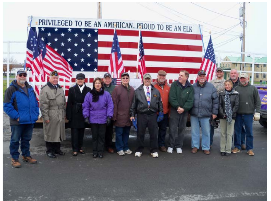
The Ontario District Elks marched along with their District Float in the annual Veterans Day Parade held at the NYS Fairgrounds on Saturday, Nov. 9, 2013. Our group consisted of fellow Elks along with some Veterans who marched with us and carried the Flags of all of our Armed Forces. Our Float was decorated with the complete set of Flag Day Flags as well as the emblems of every branch of service as well as DOD and Homeland Security. The District has been involved in this Parade for many years and will continue to honor our Veterans in this event in the future.