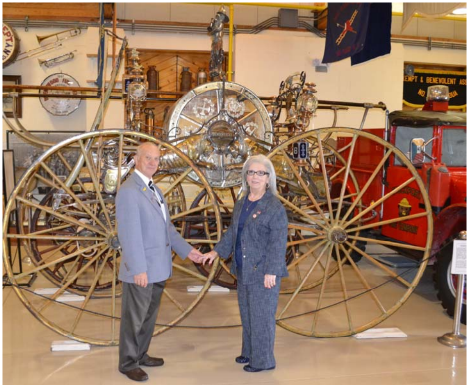
Hudson Fireman's Home Museum