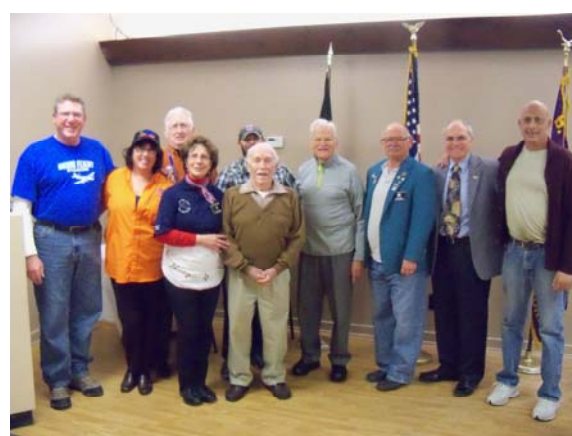
Camillus Lodge #2367 held their 1st annual Veterans Appreciation Breakfast at their Lodge. This event was an All-You-Can-Eat Breakfast that was free of charge to any and all Veterans and active duty military personnel. The event was a huge success, treating over 110 Veterans to breakfast and serving an additional 120 attendees. The local Boy Scout Troop 60 assisted with prepping, serving and cleanup for the event and attendees