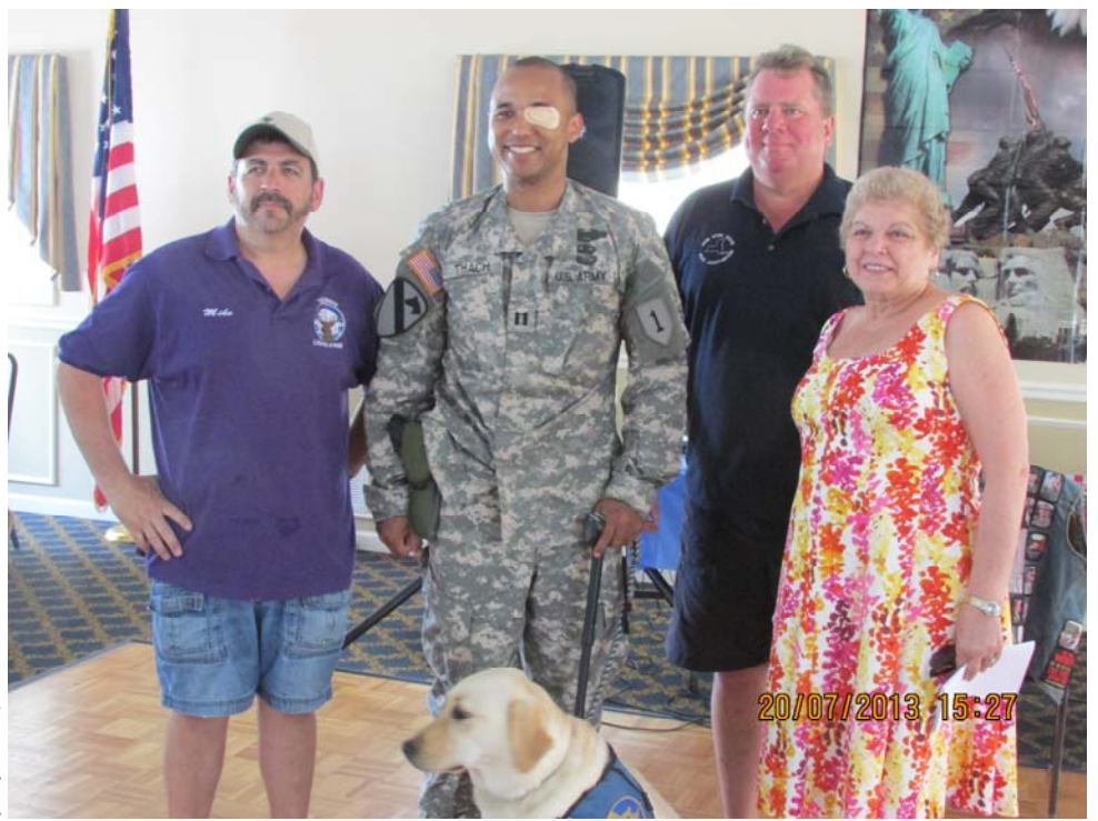
"Salute to Freedom" for Wounded Warriors of America

Your donation will be used for the perpetual care and continued restoration of this Memorial. As an impressive structure with sculptures and murals by notable artists, continual upkeep is necessary for its preservation. It is our objective to sustain the interior and exterior beauty this building had at its dedication over 80 years ago. A donation to the Elks National Memorial Trust is tax-deductible under the 501c3 tax law.