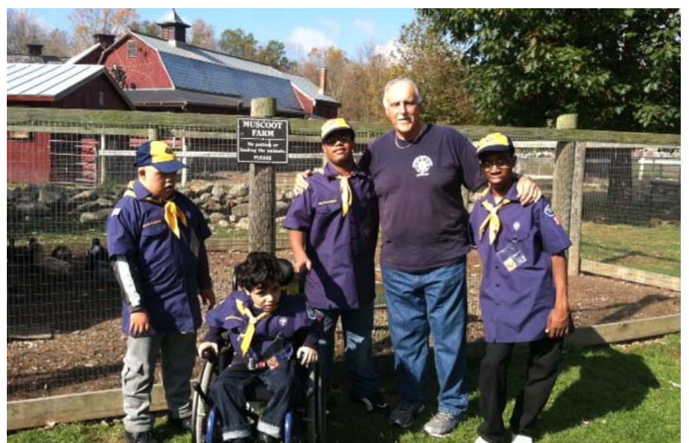
Photos to left and above Scouts visit Muscoot Farm