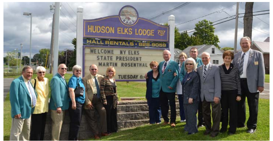
North Hudson District - Hudson Elks Lodge 787